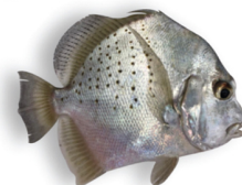
Spotted Sickletail Drepane punctata Maturity Length: 25 cm