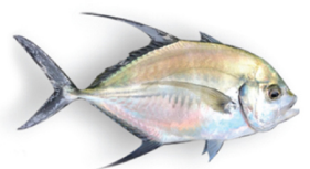
Long-Fin Trevally Carangoides armatus Maturity Length: Unknown