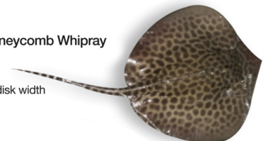
Leopard, Coach, Honeycomb Whipray Himantura leoparda Himantura uarnak Himantura undulata Maturity Length: 80 cm disk width