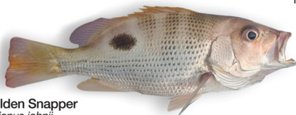
Golden Snapper Lutjanus johnii Maturity Length: 39 cm