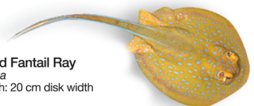
Blue-Spotted Fantail Ray Taeniura lymna Maturity Length: 20 cm disk width