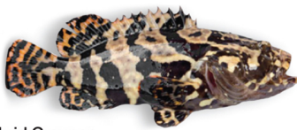
Hybrid Grouper Epinephelus fuscoguttatus X Epinephelus lanceolatus All take; invasive species

f i t /marinestewards www.marinestewards.org