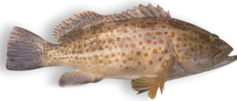
Orange-Spotted Grouper Epinephelus coioides Maturity Length: 25-30 cm Transitions: 55-75 cm