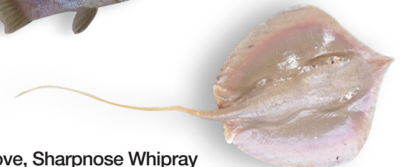
Mangrove, Sharpnose Whipray Urogyrnus granulosus , Maculabatis macrura Maturity Length: 65 cm (Male)