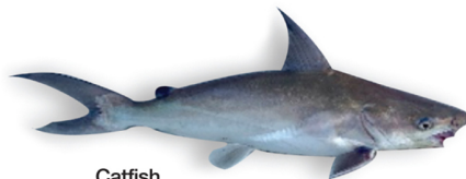
Catfish Arius venosus Maturity Length: Unknown