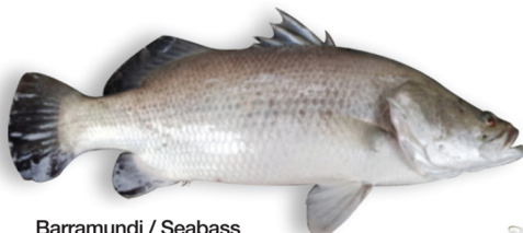
Barramundi / Seabass Lates calcarifer Maturity Length: 29-60 cm