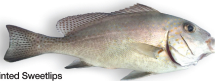
Painted Sweetlips Diagramma pictum Maturity Length: 32 cm